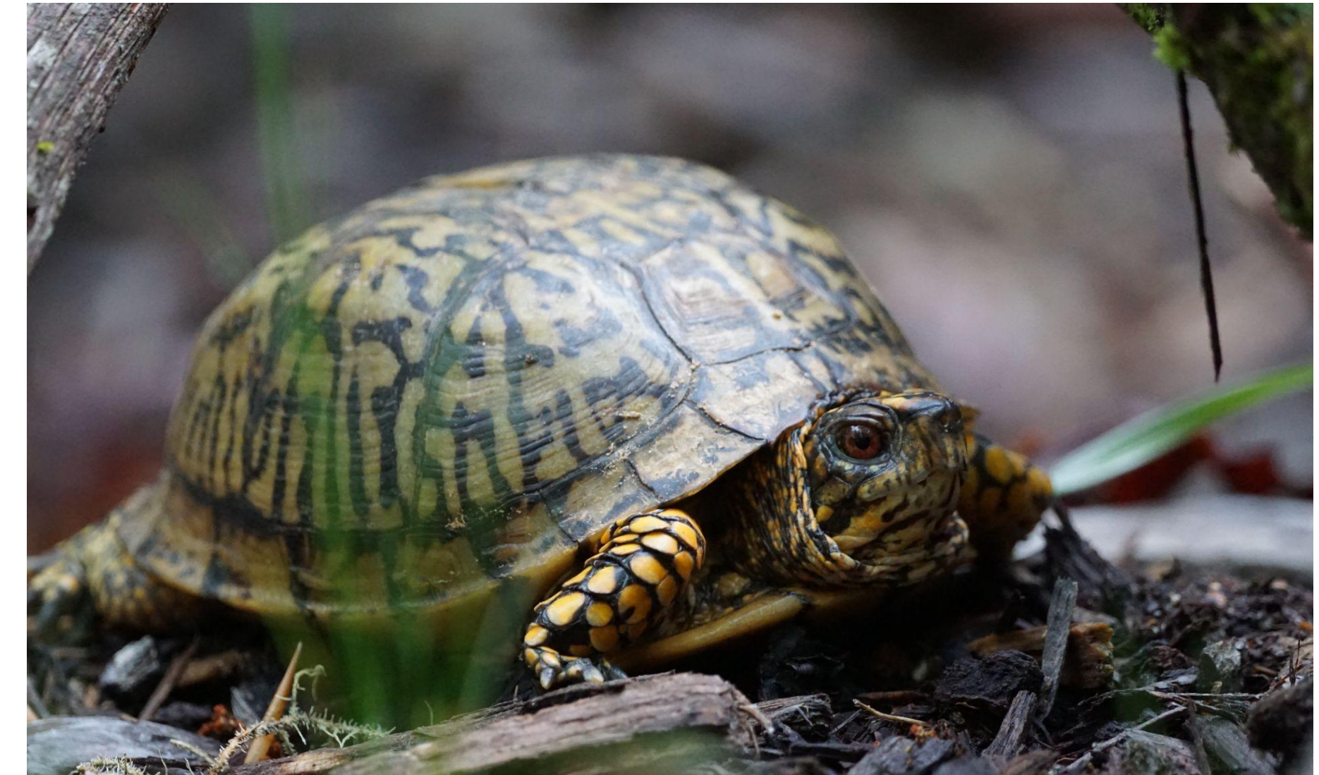
Reptiles and Amphibians