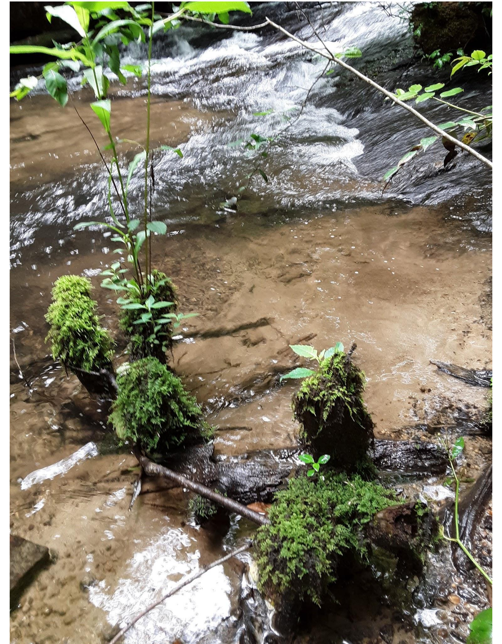
Lakes and Streams